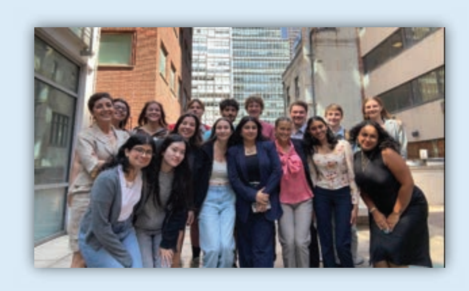
Fall 2024 Cohort at SUNY Global Center

The Global Engagement Program (GEP) offers academic coursework related to global issues and a field experience through internships . New York City offers a wealth of opportunity for students to gain hands on experience in the world of international affairs. The presence of the United Nations Secretariat and offices of all UN related organizations offers possibilities for students in many fields of study related to global affairs including education, the arts, the social and natural sciences, and business. GEP offers an opportunity to have a global experience while remaining within New York state.